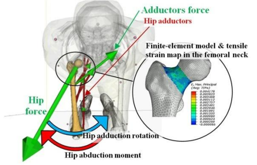
Figure 1: The musculoskeletal and finite-element models.

Medical image and dissection data of a donor (female, 81 yr, 63 kg, 167 cm) available from a public data repository [2] were used to create a lower-limb musculoskeletal model and a corresponding FE model of the femur. The FE model of the femur was created from computed-tomography images following a well-established procedure [3]. It was then validated using experimental loads and measured surface strains reported for the same femur [2].