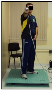
Figure 1: The shooters executed the shots holding the weapon with one hand only, standing on the force plate.

To classify the shots, it was selected the 10 best and 10 worst shots of each subjects, among the 35 shots, based on the standard deviations in X and Y directions of APF (Dev_X and Dev_Y).