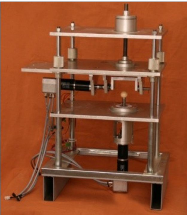
Figure 1: Experimental device

Test device is equipped with two MAXON RE36 DC drives and planetary gearboxes MAXON GB42. Upper tray is connected with actuator through flexible joint. Upper actuator simulates one part of combined motion (walking), that is inclination. The main step is simulated by lower actuator (step forward). Lower actuator is connected with clevis containing the head of hip joint. The tray with cast-in joint cup is connected through flexible joint with upper element. Actuators of the test device are controlled by EPOS unit by MAXON (Figure 1).