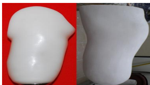
Figure 1: Difference in socket shape can be detected between the PTB (left) and hydro-cast (right) sockets.

This paper describes the efficiency of hydro-cast sockets studied through stump-socket pressure maps and gait analysis.