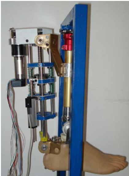
Figure 1: General view of the below-knee prosthesis.

In order to contribute to the developments of new kinds of prosthetic system and to remove the insufficient properties of the passive prostheses, a force controlled elastic prosthesis mechanism that can be utilized as artificial ankle and knee joints for active lower extremity prostheses was designed as a mechanism consisting of brushless dc-servomotor, ball-nut and screw, elastic component, measuring elements, guide columns, ball bearings and bushes.