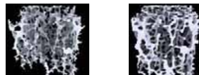
Figure 1: Scaled version of a normal (right) and osteopenic (left) bone cubes were made using rapid prototyping system.

Vibrational Analysis [3, 4]: Dynamical responses were carried out by attaching the bone cubes to an active electro-dynamic shaker while simultaneously recording acceleration and dynamic force. Frequency Response Function (FRF) measurements were made using random broad band excitation signal. A sample rate of 2000 S/s with a Hanning time domain window allowed for a frequency resolution of 0.1 [Hz]. The experiments on the cubes were repeated three times in alternative order to ensure accuracy of the results. The power spectrums of the force and acceleration signals were computed. Acceleration signals were processed to derive velocity and displacement signals. Dynamic stiffness, half-peak bandwidth, and damping ratio ( \zeta ) for both bone cubes were calculated using FRF measurements, and other techniques.