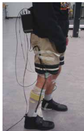
Figure 2: Equipment used.

Gwent, UK). Data were recorded at 100 Hz on a portable data logger (Porti-24/ASD, TMS Int., Enschede, NL) (see figure 2).