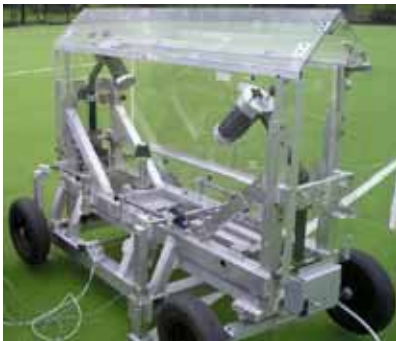
Figure 1: Strathclyde turf testing rig

The Strathclyde turf testing rig (Fig. 1) was designed to be portable, so that surfaces can be tested in situ . The rig was based on a drop-mass/spring/mass system. The basic operation of the test rig involved the use of two weighted pendulum systems to apply loads in a vertical, horizontal and rotational direction. Electromagnets were triggered to release the pendulums at the same time. Loads were applied to a test foot with a pimped rubber or studded tread design to allow testing on different types of surfaces. A force transducer/accelerometer complex, positioned just above the test foot provided a measurement of the applied impact loads and accelerations.