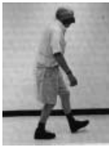
Figure 1: Compensatory forward trunk lean due to FHL (Dananberg, et al., 1996)

Humans are the only species to successfully walk using an erect bipedal posture. The unique design of human feet, more so the first metatarsophalangeal (MTP) joint allows us to walk in a relatively upright position, to facilitate the efficiency of the inverted pendulum (Winter, 1995). An obstruction, inability or delay of the inverted pendulum to move through the sagittal plane is referred to as sagittal plane blockage. One source of sagittal plane blockage is the inability or delay of the first MTP joint to permit adequate dorsiflexion from late stance phase, to toe-off during gait. This condition is referred to as Functional Hallux Limitus (FHL) . Podiatric clinicians suggest that FHL can result in slight disruptions of the inverted pendulum's centre of gravity (CoG) through the sagittal plane (Winter, 1995; Dananberg, 1986, 1993). According to clinicians, FHL leads to compensatory postural changes such as a forward lean to restore the pendulum. Clinicians suggest this FHL compensatory action may be a contributor to low back pain.